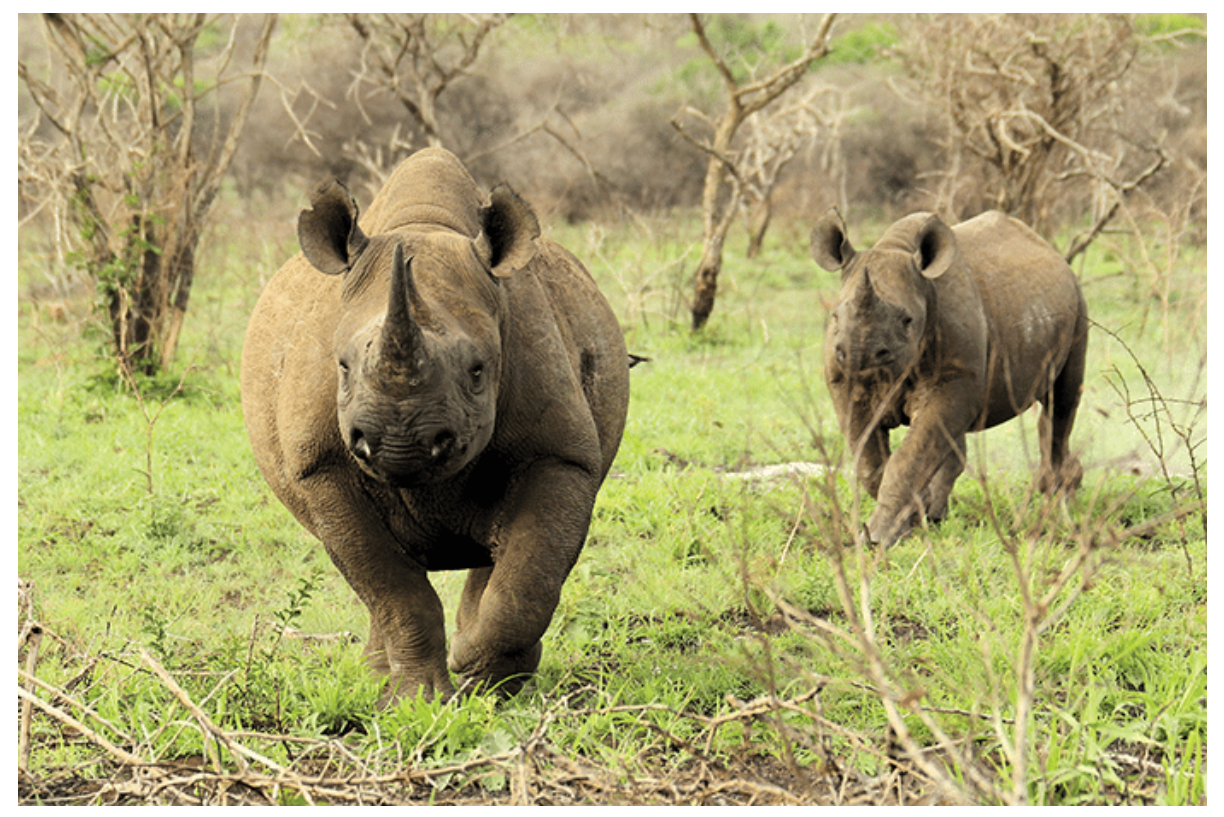
The rhino-tracking walking safari allows quests to get up close to these amazing animals and learn about conservation.