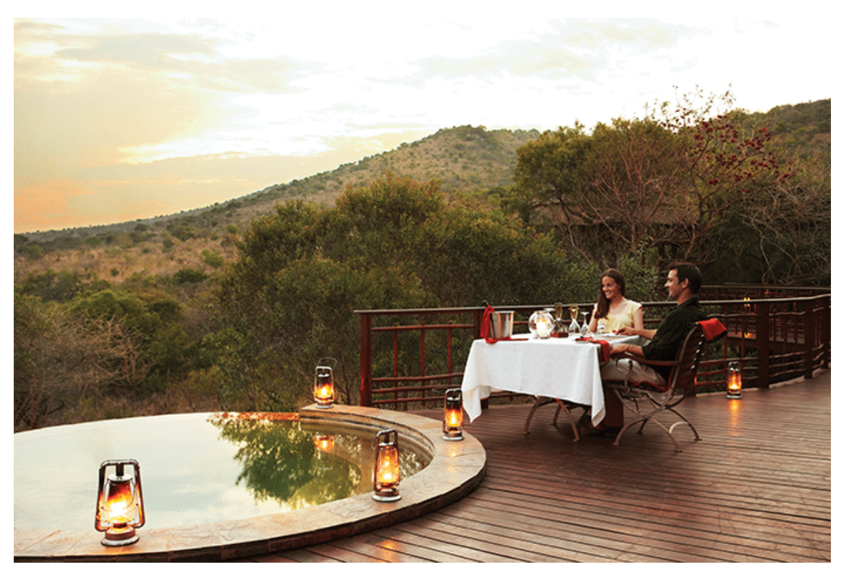
Romantic sunset dinners can be arranged at various spots throughout the property