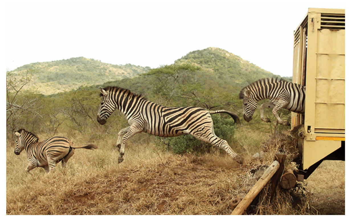
Thanda is very involved in animal conservation and habitat protection.