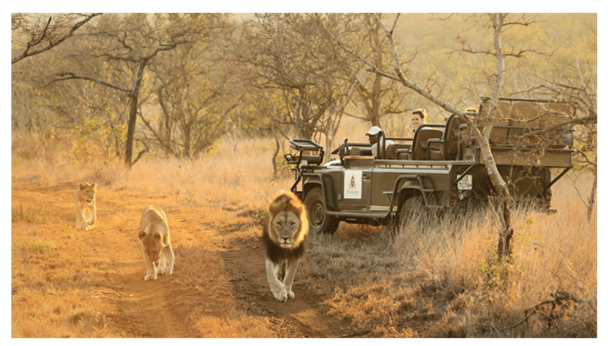
Game drives are twice a day at dawn and dusk and it's not uncommon to see lions.