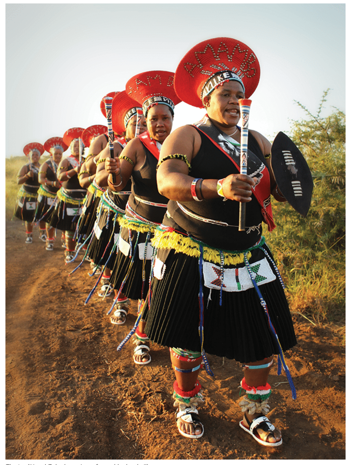
The traditional Zulu dance is performed by local village women.