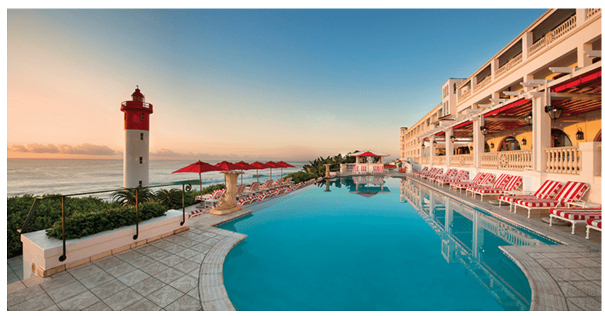
The Oyster Box Hotel is known throughout Africa for its food, spa and luxe accommodations.

schools and community projects. Guests at Thanda can choose an excursion called Following in the Footsteps of the Zulus to visit a traditional homestead and village, including a local school. Money from each excursion goes toward the Zulu fund.